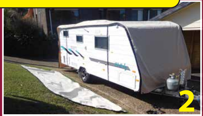
Install each side of the cover, shaped to your RV