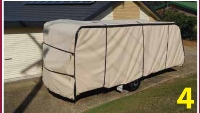
Secure cover with Straps

Fabric Designed for Extreme UV Conditions