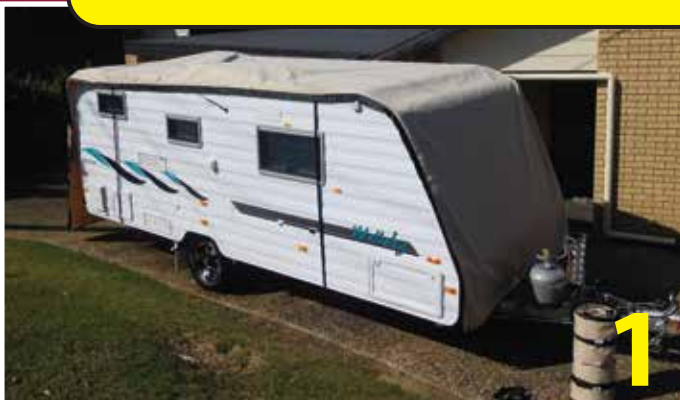
Install your Roof Piece onto Van

Unique Zip On Cover Design Provides Easiest Installation Method