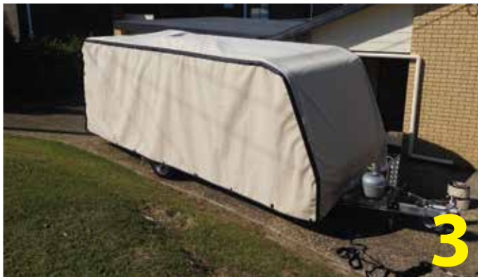
Zip all sides together